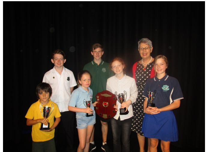
Winners of the Grand Final Rivers Public Speaking Competition 2015